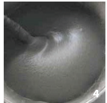
Mix Obaproof Oba Easy Coat wp thoroughly. (can add 3-5% clean water to mix container)