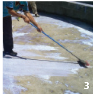
Apply Obaproof CM-700wp as primer