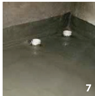
Completion of Obaproof Oba Easy Coat wp