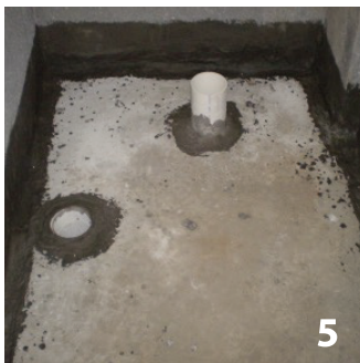
Treatment to inlet / outlet.